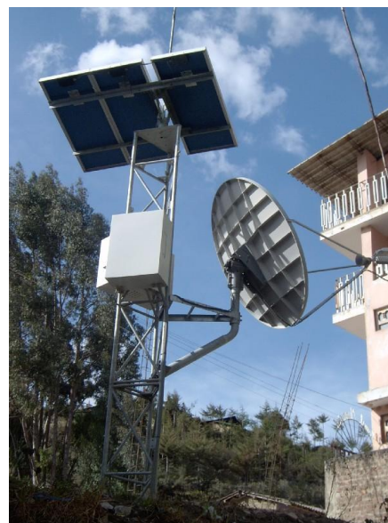
Figure 3: The La Encanada infocentre, Peru has solar panels to generate electricity and a satellite for connectivity.