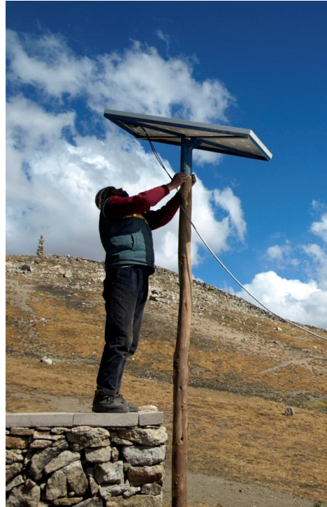
Figure 1: A photovoltaic panel being set up in rural Peru for domestic solar lighting.

Most of the world's developing countries are within the tropics and hence have ample solar insolation (the total energy per unit area received from the sun). The tropical regions also benefit from having only a small seasonal variation of solar insolation, even during the rainy season, which means that, unlike northern industrial countries, solar energy can be harnessed economically throughout the year.