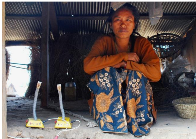
Figure 4: A woman with her locally made WLED lamps, Nepal.

In recent years solar PV has been coupled with Light Emitting Diodes (LEDs) to provide energy efficient light. Recent advancements in LED technology have led to the development of white light emitting diodes (WLEDs). WLEDs provide a bright white light that is ideal for domestic lighting. The advantage of using LEDs with solar PV systems is that the LED requires a much lower wattage (less than conventional compact fluorescent light bulbs), therefore the size and the cost of the solar system are much reduced for each household.