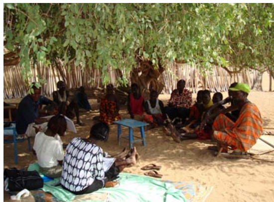
Mixed group FGD at Nadapal in Lodwar, Turkana

The process of data and information analysis included transcription of the audiotapes and analysis of the information into different categories guided by the study objectives and key information areas. Comparative analysis of findings from different regions was carried out using a grid and is included in the findings. The report provides details on findings emerging from all aspects of the study, such as stakeholder analysis and FGDs, and includes illustrations such as photographs and tables.