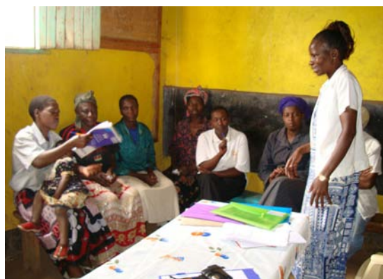
Moderating the Kibera women focus group

In the rural, urban and peri-urban areas, the main types of energy services/fuels that are used for income generating activities are charcoal and firewood. In the Nakuru urban area for example, charcoal is regarded as a convenient energy service/fuel since the stove can fit into small confined spaces. In the Kisumu rural region women FGD participants engaged in preparation and sale of food items for income generation expressed a preference for charcoal. They noted that although charcoal is expensive the heat is easy to control and this improves the quality of food products such as mandazi and chapati. In the same region, FGD participants who expressed a preference for using firewood in income generating activities said it is cheaper, lasts longer than charcoal and attracts higher profits because the costs are lower.