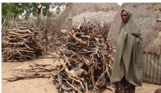
A firewood vendor in Mandera

As the following quotation from a woman in Turkana rural region attests to, the women use traditional methods to burn charcoal for domestic consumption: “We cut firewood into small pieces. We dig small pits and arrange firewood in the ditches then put goat’s droppings on top and light. The charcoal burns slowly without being disturbed by the wind.”