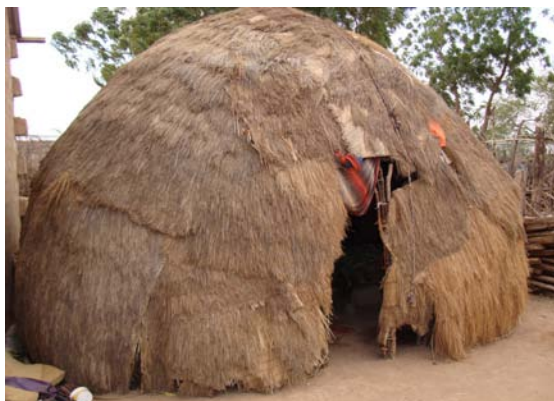
A typical Somali hori constructed by women

Levels of awareness on the advantages and disadvantages of using different types of bioenergy services/fuels are quite high in both rural and urban. For instance, charcoal is generally regarded as a clean, easy to use fuel that also helps to reduce the risk of diseases such as coughing, chest problems and deterioration of the eyesight.