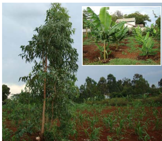
Example of agroforestry in Kisumu showing maize intercropped with eucalyptus species. Inset: a stand of bananas, which are planted in the region for food security

In Kisumu and Nakuru a variety of subsistence crops are grown for example grains, legumes, indigenous and exotic vegetables and fruits and other crops. In the Kisumu rural cluster for example, subsistence crops include maize, bananas, cowpeas and kales, among others. They also rear chicken and keep animals such as cattle. In most cases the harvest is supplemented with food from the market, which residents cited as expensive.