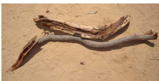
In Mandera two tiny pieces of firewood like these ones cost 25 shillings

Women from Nakuru, Kisumu and Kibera have also devised a way of making charcoal balls for fuel. The balls are made with a mixture of charcoal dust, soil or ash and water as a binding agent. Once dry the charcoal balls are used in combination with charcoal to ensure they light well. For example, participants in Nakuru and Kibera FGDs said they make and use the charcoal balls, which are economical.