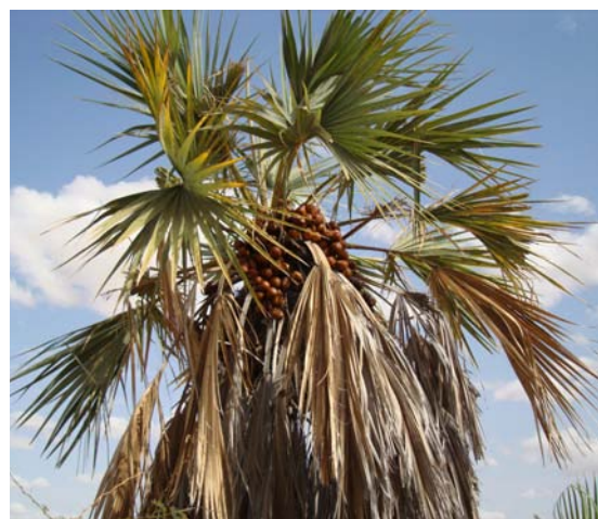
Duom palm fruits and leaves in Turkana

Ecologically the doum palm is an important soil stabilizer and is evergreen. Although its wood is hollow and retains a lot of water, which means it is not a good source of bioenergy; the species provides abundant fruits - which are mainly available during the rainy season. It also provides seeds and leaves. FGD participants said women harvest the fruits and bring them home to be eaten, especially by children. Doum palm seeds are also peeled and soaked in water to form a tasty liquid that can accompany maize meal in case vegetables and meat are not available. FGD participants in Turkana peri-urban region also said they dry doum palm seeds and use them as fuel. The seeds were also cited as a good source of charcoal while fishmongers use the seeds to smoke fish. However FGD participants said the seeds produce immense heat that damages cooking utensils, especially if they are of poor quality. Dry doum palm leaves are used for weaving mats and baskets as a source of cash income for women. The leaves are also used for lighting, fencing and construction of the traditional Turkana manyatta.