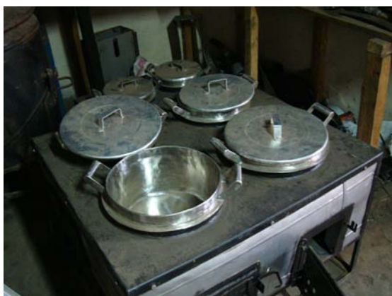
Example of an energy saving Institutional stove with fitted pots developed by Mussoo Engineering on display at Kisumu. Mussoo is an income generating initiative implemented by a youth group in the urban and rural areas of Kisumu, Nyanza and Baringo districts

As part of the PISCES baseline research, in-depth interviews were conducted with a sample of institutions using bioenergy with the aim of assessing energy access and delivery in the institutions. The sampled institutions include three primary schools, three youth training institutions, two public hospitals and three hotels. While hotels have a more flexible budget and can access a wider variety of food, the majority of public institutions especially schools operate a relatively small budget and access only a few types of food especially maize and beans, pulses, maize meal (ugali), rice, kales and beverages. Public schools rely on the school-feeding programme that is run by