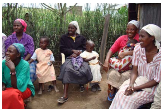
Nakuru women FGD participants in a jovial mood during discussions

Due to the nature of prevailing gender roles in the target areas, a majority of the FGD participants were women, while there were only five mixed groups and no men-only groups. The age of FGD participants was 26-45 years while household size ranged from four to six. All households had a monthly income of less than eight thousand Kenya shillings. FGD group size was generally 9-13 members with an average of 11 persons per group, except for Nakuru rural women and Kisumu urban women, which recorded 14 and 7 participants, respectively. Table 1 shows the number of FGD participants by site, gender, category and dates.