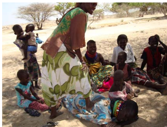
A woman (standing) from Turkana FGD demonstrates how the women usually massage each other's back to ease the pain of fetching firewood. At the foreground is a woman lying flat on her stomach as her back is massaged

Women from rural regions cited various health effects of collecting and using fuels such as firewood, agricultural residues, papyrus roots and cow dung. The most common health effects of collecting and carrying firewood include extreme tiredness, headache, a stiff back and pain in the legs, back, chest, ribs and shoulders. The most commonly cited health effects of using firewood are coughing, teary eyes, loss of eyebrows, dehydration, chest and eye problems resulting from continuous exposure to smoke, loss of appetite as