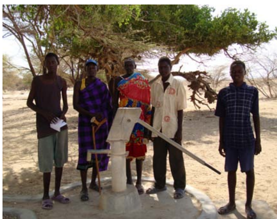
Young Turkana men at dry water well in Naisinger

Although access to clean water is a common constraint in all the clusters surveyed, the situation is most critical in Turkana region where most people obtain water from distant rivers and remote wells. Fetching water for domestic use is primarily viewed as a woman's job although children help sometimes. The water sources are very far from home and women walk long distances to fetch and carry the water back home. They also take great risks accessing precarious wells.