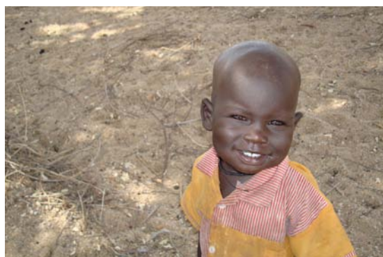
A joyful Turkana lad at Naisinger village

FGD participants demonstrated a strong sense of willingness to learn if given the opportunity. They expressed the need for information on alternative technologies/ sources of fuel such as the fireless basket, solar and biogas as well the cost and affordability of such fuels.