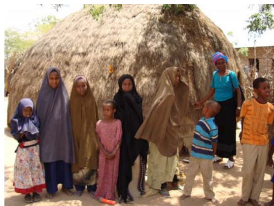
Women and children at a home in Mandera during the survey

Locally available resources include human resources, land, water and vegetation. However, the availability and distribution of such resources is region specific. In addition, access, sustainability and use of these resources in both the short and long-term may be affected by constraints such as land degradation, drought and increasing deforestation. In Mandera and Turkana for example, the invasive species prosopis juriflora grows abundantly and could be exploited as a source of fuel. However, there is need for further research on the thorny species to determine how it can be harnessed for production of charcoal as a biofuel. Also located within the same districts are large tracts of land that can be exploited for production of drought resistant tree species for fuel and income generation.