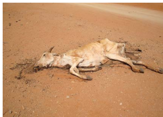
Carcass of a cow at Burabb in Mandera

FGD participants in Turkana and Mandera regions indicated that many animals have died as a result of drought and disease leading to reliance on relief food and a worsening poverty situation. In rural Turkana for example, women FGD participants said they used to have many animals, which they used to sell and buy food. Now, however, the animals have died and they rely on relief food. “Even for those of us who have farms, there is nothing in the farm,” said a woman from the Mandera rural FGD. The women explained that although they know how to plant crops, there is no rain or water for irrigation while the soils are poor and unable to support healthy crops.