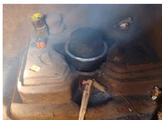
Upesi energy saving stove cooking food in one of the survey regions

FGD results also indicated that many people especially in the urban and peri-urban regions are aware of alternative sources of fuel such as electricity and gas but such fuels are priced out of their reach. Even in the relatively better off urban regions only a few participants said they can afford to use electricity for lighting. A woman FGD participant from the Kisumu urban cluster said: “We long to use electricity but we cannot afford.”