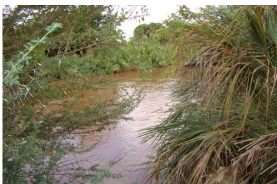
River Dauwa in Mandera district

In Mandera rural region women FGD participants said they obtain water from the nearby river and carry it home. Alternatively the women buy water from donkey cart vendors who sell it at 10 shillings per 20 litres of water. In contrast, a majority of FGD participants in Mandera urban region said that although water is easily available from the river it is not clean and they prefer to buy clean water from vendors; however, they do occasionally fetch water from the river. In Lodwar peri-urban region in Mandera, water is obtained from a pump managed by a local church and fetching it takes about one hour. In both Mandera and Turkana irrigation is practised on small plots along the river but the returns are meagre.