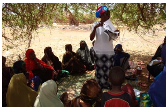
Mandera rural women during the FGD held at Bur Aborr

Focus Group Discussion guidelines were developed to ensure that key information on bioenergy access and delivery was collected. The guide was designed to capture information on socio-demographics, food security, farming and other economic activities, land and water issues, energy services and key bioenergy resources, uses and costs. The guide also sought information on gender roles in bioenergy access as well as factors influencing the level, model and choice of delivery and access to bioenergy and barriers and opportunities at the user level. Gender was incorporated throughout the guide as a crosscutting theme of the study.