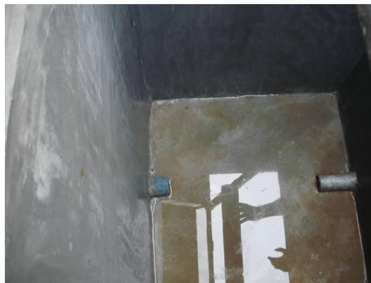
Figure 3: Typical Chamber of a plant.