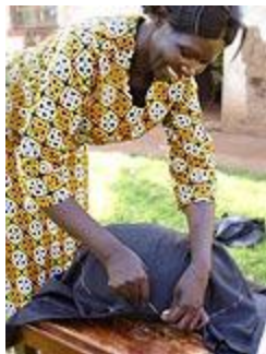
Figure 7: Two cloth cushions are packed around the top and bottom of the pot.

The insulation is densely packed so that there is just enough room to fit the pot without any gaps for heat to escape from. A lining of tough cloth needs to be cut so it can be used to protect the cloth and insulation. It is circular in shape, to avoid waste, but any shape will work as long as it can fit all around without the need for an extra piece. A good seamstress can use several waste pieces quite economically and still get a good fit. It also needs to be slightly bigger than the basket as the lining is attached on the outside of the basket. The lining is stitched to hold the insulation in position. A dry heat-resistant polythene cover is fitted over the lining on the inside, to protect and prevent moisture from getting into the insulating material as this reduces the effectiveness of the insulation.