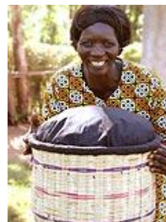
Figure 8: A fireless cooker, ready to use.