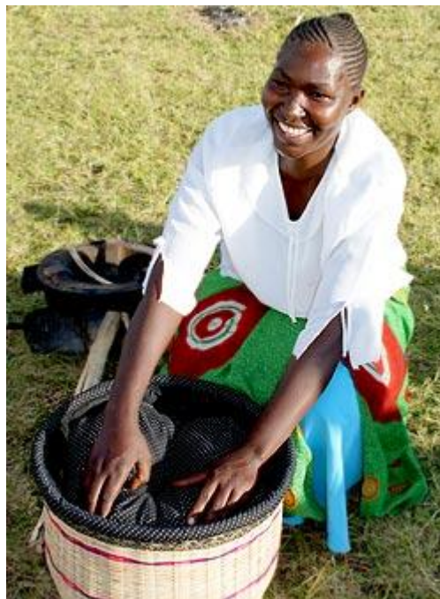
Figure 1: a new fireless cooker on show with a ceramic jiko stove in the background.

It was one of a series of interventions introduced by Practical Action in Kenya to alleviate smoke along with smoke hoods, improved stove designs, structural changes to traditional houses such as the introduction of larger windows and solar cookers. These cookits parabolic solar cookers were promoted in partnership with Solar Cookers International, which was the technical partner for solar technology.