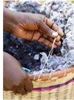
Figure 4: The insulating material is sewn into a strong basket or box.

When cooking, a metal plate is put inside the basket and filled with hot sand and wood ash. This ensures that there is sufficient heat to cook food properly.