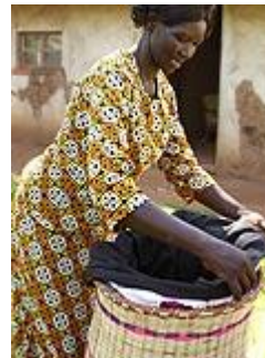
Figure 6: A lining of tough cloth is glued or pinned to hold the insulation in position.