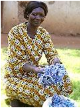
Figure 3: Locally-available material such as recycled clothing is collected for insulation.

In Kenya the main structure was provided by means of a basket. The basket may be bought or it can be made by the user. However, the structure does not need to be made from a basket, a wooden box or other containers would be just as suitable.