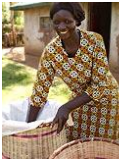
Figure 5: Dry heat-resistant polythene covers line the cloth on the inside.

The inside of the container is then fitted with a lining which is then stuffed with the insulating material. Insulation can be made from a variety of materials, straw or hay can be used, hence the name hay box which is used for fireless cookers. In the case of the work in Kenya, recycled clothing was used. The basket or container needs to be quite large so that there is room for the pot and the insulating material. The general approach is to use the size of the biggest pot, being used for cooking, to select the basket size.