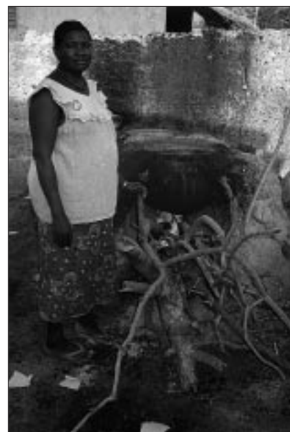
Figure 1: Brewing dolo in Burkina Faso