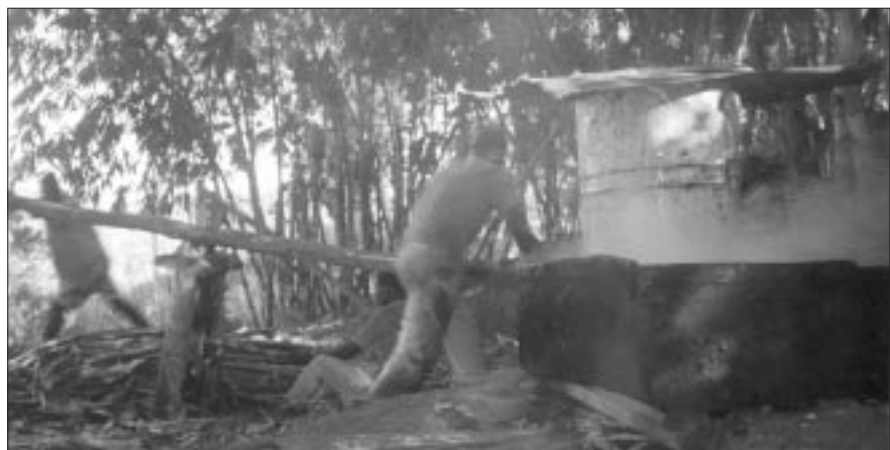
Figure 2: Brewing beer from sugarcane, Usambara Mountains, Tanzania

Critically, unlike household cooking, brewing needs large logs for cooking large quantities (i.e. 44 gallons) sustained over many hours at medium heat. Therefore, it is usually live wood deliberately cut as felled branches or whole