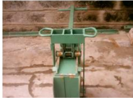
The block making machine.

The machine is selling at 55,000 Kenya Shillings, 725 US Dollars, 466 GB Pounds or 529 Euros