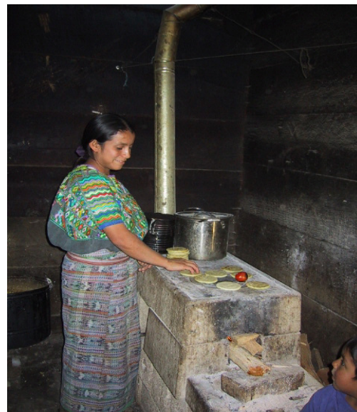
Figure 1: A well-designed chimney stove disseminated by HELPS International in Central America.

Clips at the top and bottom of the flue mean that it can be easily removed for cleaning. The opening for the fuel is exactly the right size, and there is a small bar across the opening close to the bottom to ensure that air can pass underneath the fuel so that the fuel burns completely. The material for the stove is based on a