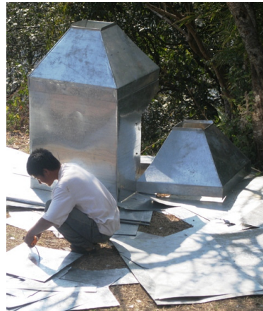
Figure 5: Manufacturing a smoke hood using hand tool in Nepal.

Both chimney stoves and smoke hoods are quite expensive if you are on a very low income. However, the major problem is finding all the money at once – the up-front or capital costs . Once installed, the technologies often save fuel costs for reasons described above. One way to enable purchase of hoods and stoves is to create revolving funds . These funds are based on seed capital – an amount of money that starts off the process. A few households belonging to a community group, will buy the appliance in instalments; sometimes paying a low additional interest rate to provide a small income for the person running the fund. Once they have paid back some of the money, this provides enough funds for a few more people to get appliances. The larger the seed capital, the sooner everyone gets a chance to reduce smoke in their kitchen.