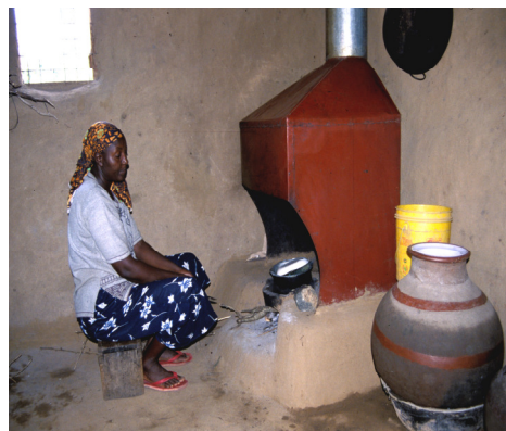
Figure 3: Woman cooking with her stove and smoke hood, Kenya.

In Kenya, the well-known low-cost upes i stove is built under the hood in place of the open fire, as in Figure 4. The upes i is a well-accepted ceramic stove which can be built into a base, with the hood set over the top to provide a neat safe environment – reducing the risk of burns and reducing the fuel costs. Another type of stove, built on a principle called a ‘rocket’ stove, is becoming very popular. This could be