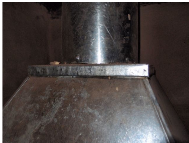
Figure 6: Detail of the metal fold at the hood intersection.