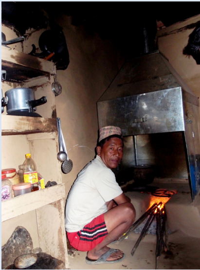
Figure 3: Using the smoke hood to brew tea - Gorkha region, Nepal.