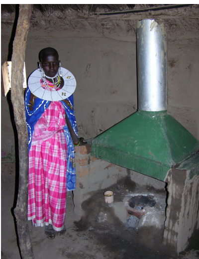
Figure 4: Maasai woman standing beside her smoke hood, Tanzania.

combined with a smoke hood, with the stove reducing emissions and fuel costs, and the smoke hood venting any residual smoke up the smoke hood. The smoke hood is sufficiently versatile to allow these changes to happen.