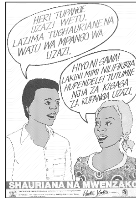
A poster promoting family

In December 1998, the project team asked a sample of women's group leaders to identify the civic education needs of their communities. These women were later invited to Nairobi, along with local chiefs, for a meeting. After the meeting, the group leaders began developing education materials. They chose posters as the best medium because of the semi-literate nature of their communities. The women identified 10 issues of concern, and those issues dictated the design of the posters.