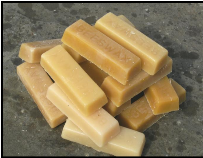
Ibishashara byamaze gutunganywa byo muri Malawi