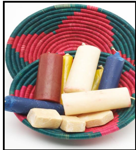
Ibikoresho bikoze mu bishashara byakorewe i Bugande, byakozwe na Hives Save Lives Africa